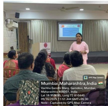
Mumbai, Maharashtra, India Vachha Gandhi Marg, Gamdevi, Mumbai, Maharashtra 400007, India Lat 18.959695, Long 72.810440 09/16/2025 11:51 AM GMT+05:30 Note : Captured by GPS Map Camera