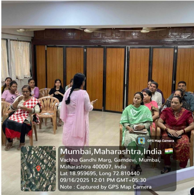
Mumbai, Maharashtra, India Vachha Gandhi Marg, Gamdevi, Mumbai, Maharashtra 400007, India Lat 18.959695, Long 72.810440 09/16/2025 12:01 PM GMT+05:30 Note : Captured by GPS Map Camera