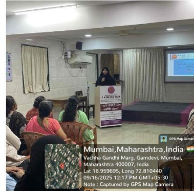
Mumbai, Maharashtra, India Vachha Gandhi Marg, Gamdevi, Mumbai, Maharashtra 400007, India Lat 18.959695, Long 72.810440 09/16/2025 12:17 PM GMT+05:30 Note : Captured by GPS Map Camera