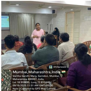
Mumbai, Maharashtra, India Vachha Gandhi Marg, Gamdevi, Mumbai, Maharashtra 400007, India Lat 18.959695, Long 72.810440 09/16/2025 11:51 AM GMT+05:30