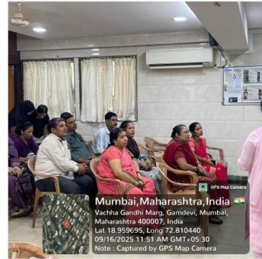
Mumbai, Maharashtra, India Vachha Gandhi Marg, Gamdevi, Mumbai, Maharashtra 400007, India Lat 18.959695, Long 72.810440 09/16/2025 11:51 AM GMT+05:30 Note : Captured by GPS Map Camera