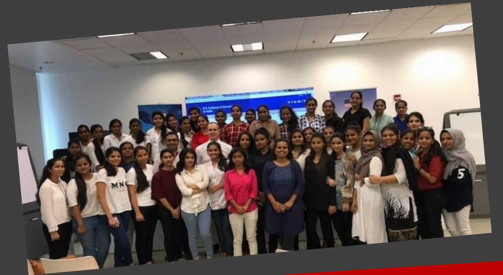
Visit to US Consulate Library