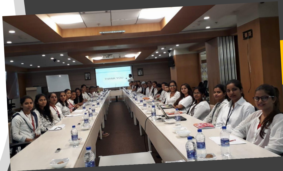
Visit to SEBI