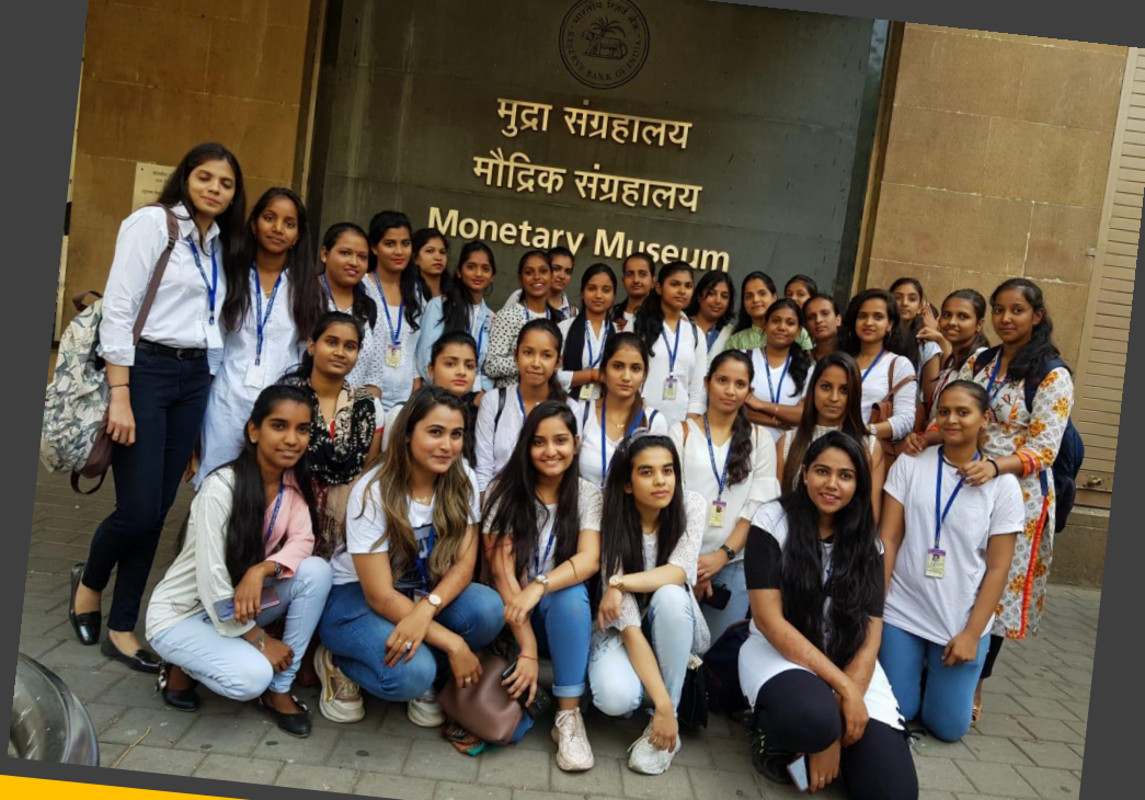
Visit to RBI Monetary Museum