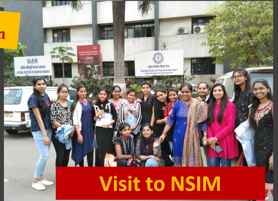
Visit to NSIM