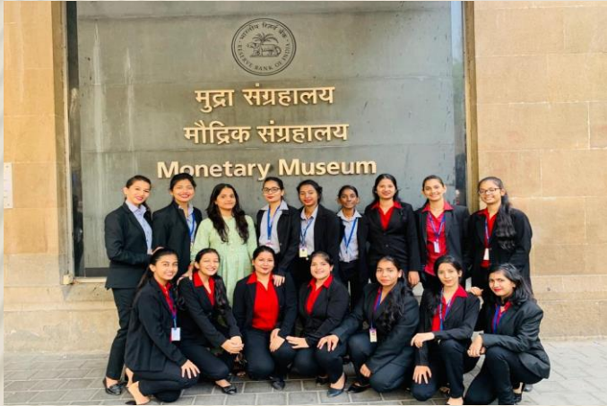
RBI Monetary Museum (Mumbai)