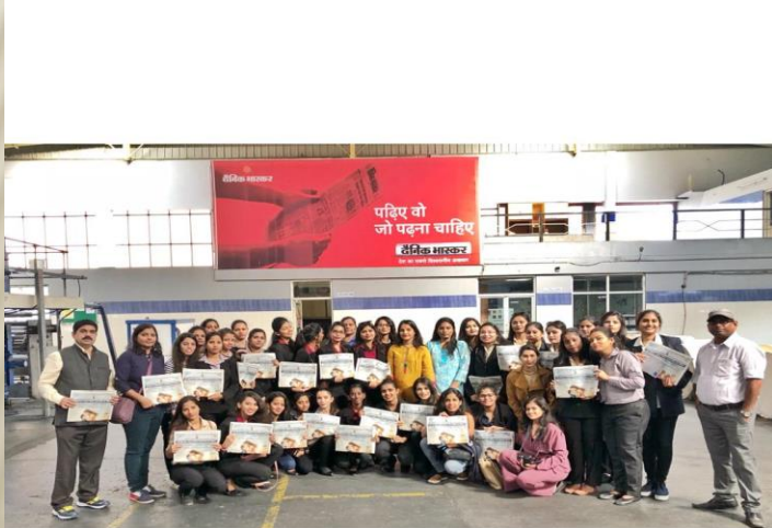
Dainik Bhaskar (Jodhpur)