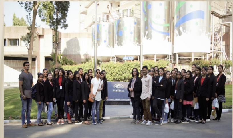
Amul (Anand, Gujarat)