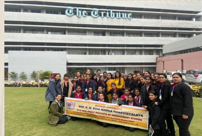
The Tribune (Chandigarh)