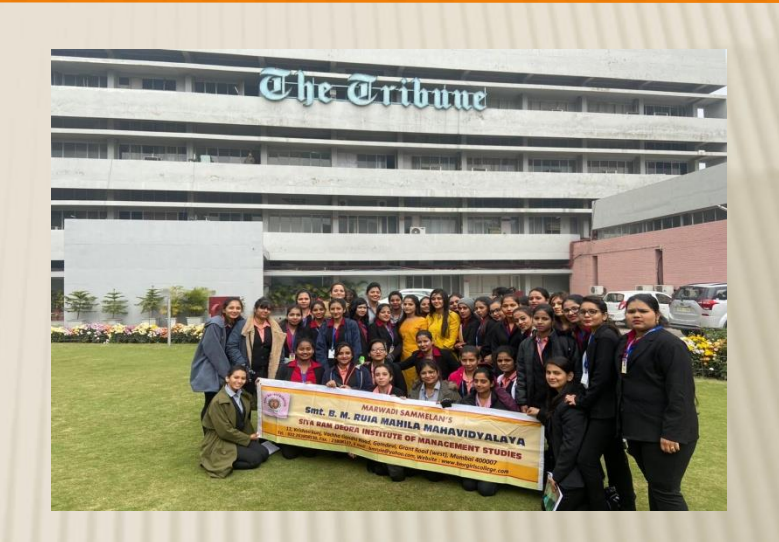
The Tribune (Chandigarh)