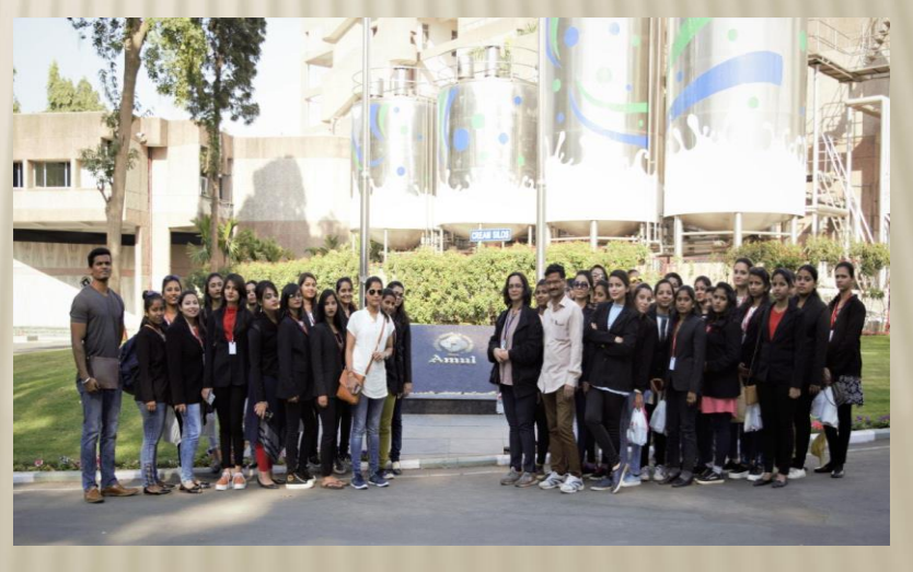
Amul (Anand, Gujarat)