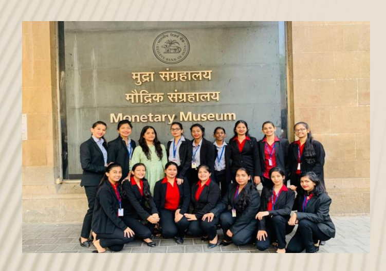
RBI Monetary Museum (Mumbai)