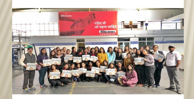
Dainik Bhaskar (Jodhpur)